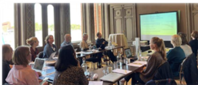
Pic: Senior Researcher workshop